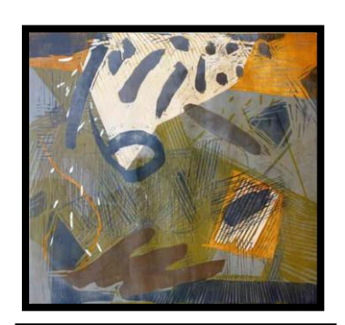
Panel (11) Cairo Atelier