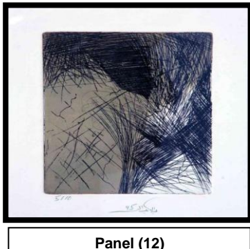
Panel (12) Cairo Atelier